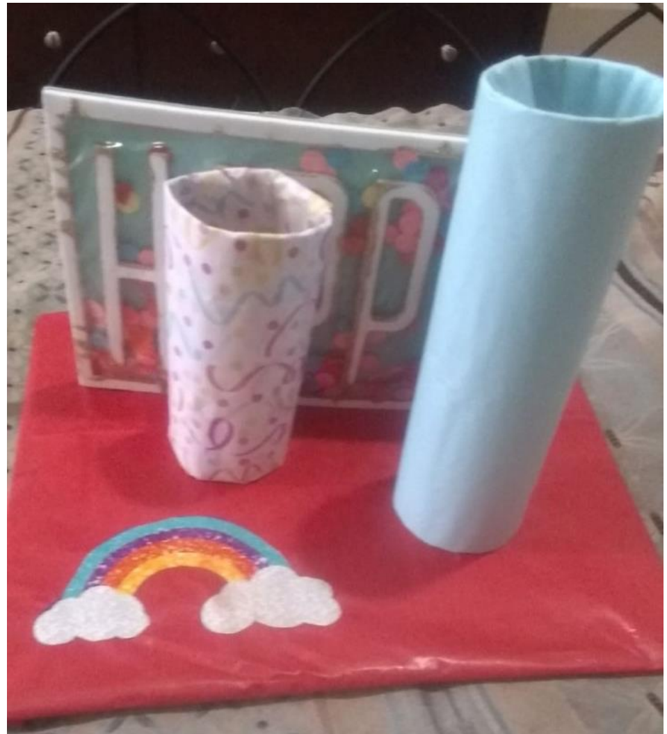
Alejandro Turcios -Decorative Pencil holder 4P

Desk organizers- Students in Zoom session assisted with Spanish translation. Teacher used google translate to send written replies.